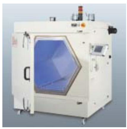
VHM 100/100 HEPHAISTOS