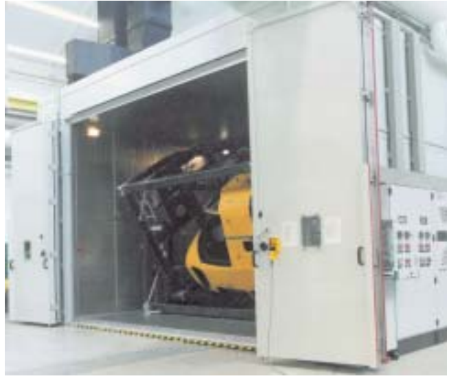
Recirculation air tempering oven with mobile rotating frame for CFRP helicopter cockpits