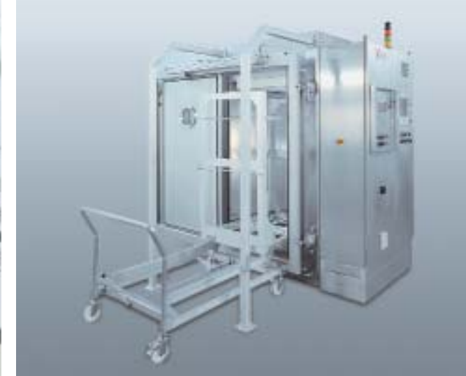
Vacuum heating and drying oven – Microwave-heated design available as option